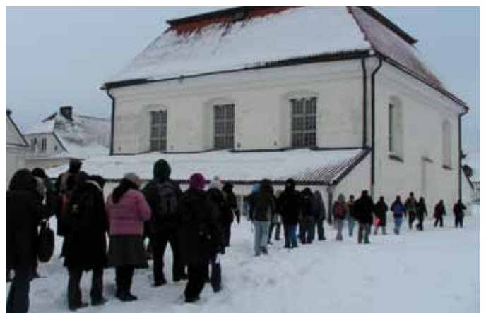
Pardes visit to Tykocin, Poland