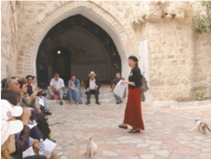
Soda Club Continuing Education Tour of Heavenly Jerusalem

The Fellows Program offers students a deeper, richer relationship to Jewish texts and tradition, along with the tools and knowledge to communicate and lead, in a compelling, open manner the Jewish communities they join after their time at Pardes.