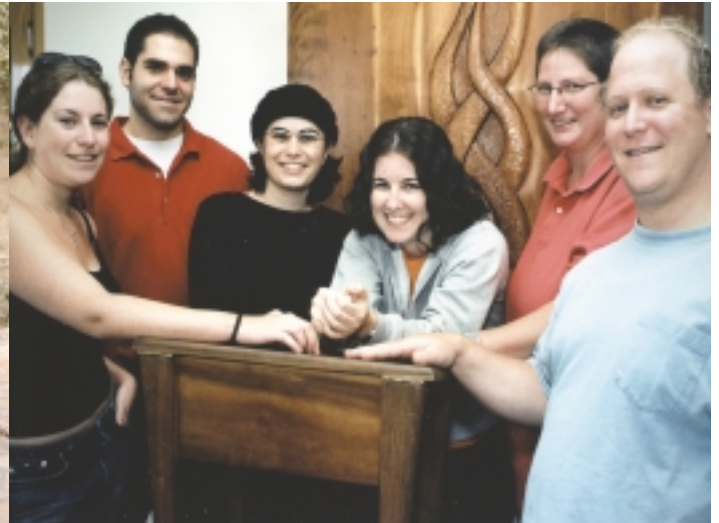
Nash Family Foundation Pardes Leadership Fellows