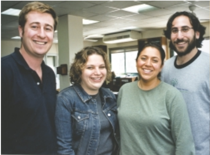
Suissa Foundation Pardes Olam Fellows

Fellows learn full-time in advanced studies; upon completion of the program, Olam Fellows work in lay and professional capacities within the North American Jewish community.